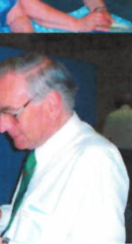
More photos from the Annual Dance